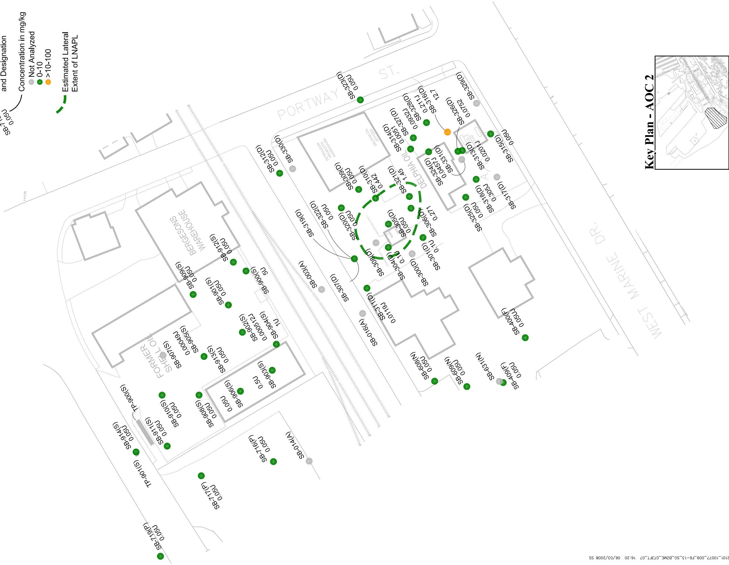
Key Plan - AOC 2